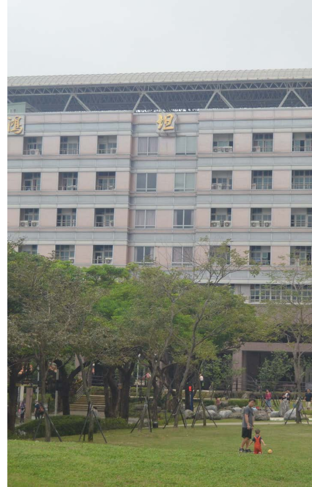
鴻坦樓 Hong Tang Building