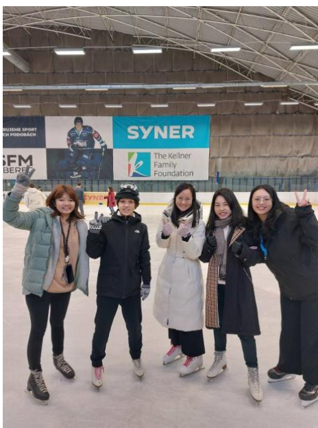
圖 3 說明(20 字)

muddy and snowy areas, which can be quite exhausting.