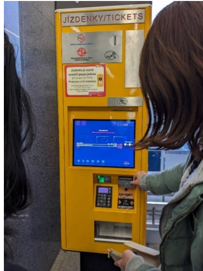
圖 1 說明(20 字)

When you arrive at Prague Airport in the Czech Republic, the first thing you need to do is buy a bus ticket. You can download the PID app to purchase tickets online, as the machines can sometimes malfunction. In addition to buying a ticket for yourself, if you have a lot of luggage, you will also need to purchase a ticket for your luggage.