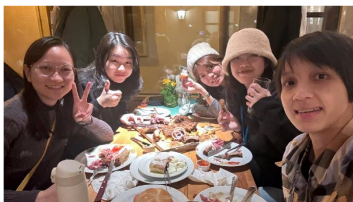
圖 4 說明(20 字)

Because Liberec is a city that experiences long periods of cold weather, many residents are very skilled at ice skating. However, ice skating can be quite challenging for Asians, as it requires a lot of balance and courage.