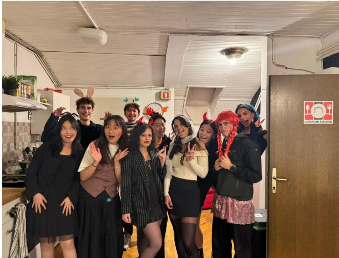
圖 2 說明(20 字) At a lively Halloween party, my roommates and I dressed up together in full costume, teaming up for an exciting beer pong tournament!