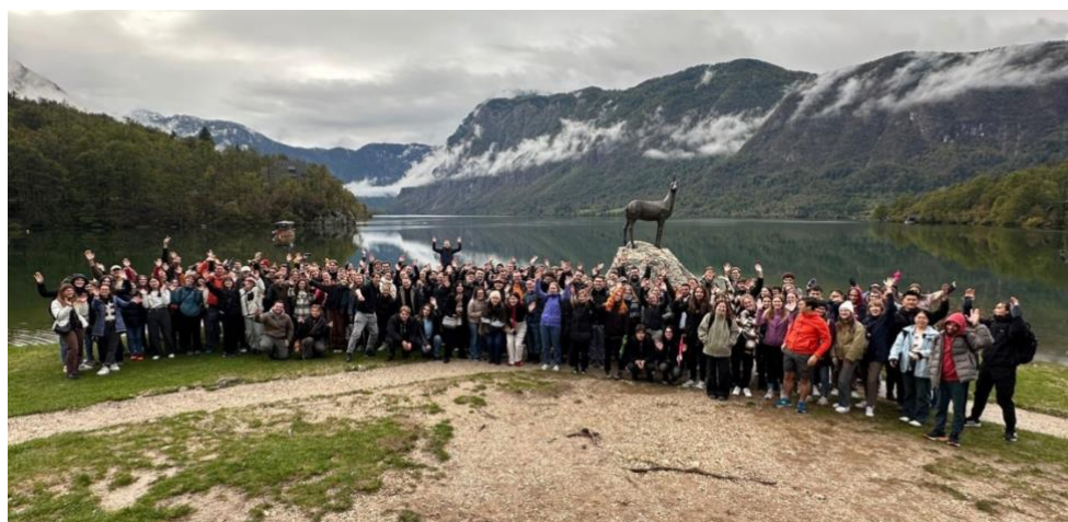
圖 1 說明(20 字) The school's ESN organized an outdoor event to Slovenia's famous Lake Bled, where I made many international friends from various countries.