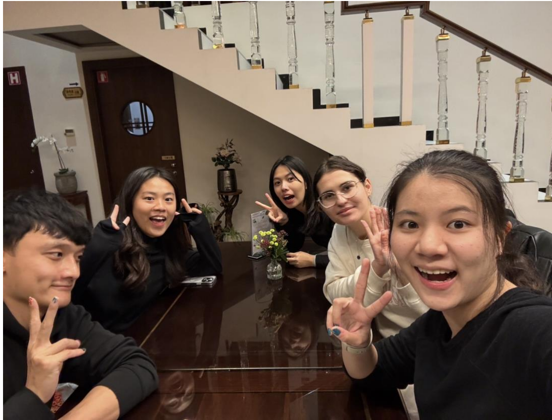
圖 3 說明(20 字) A friendly classmate from Bosnia approached me wanting to learn Chinese, beginning my tutoring journey here. This photo shows us dining with other Taiwanese friends.