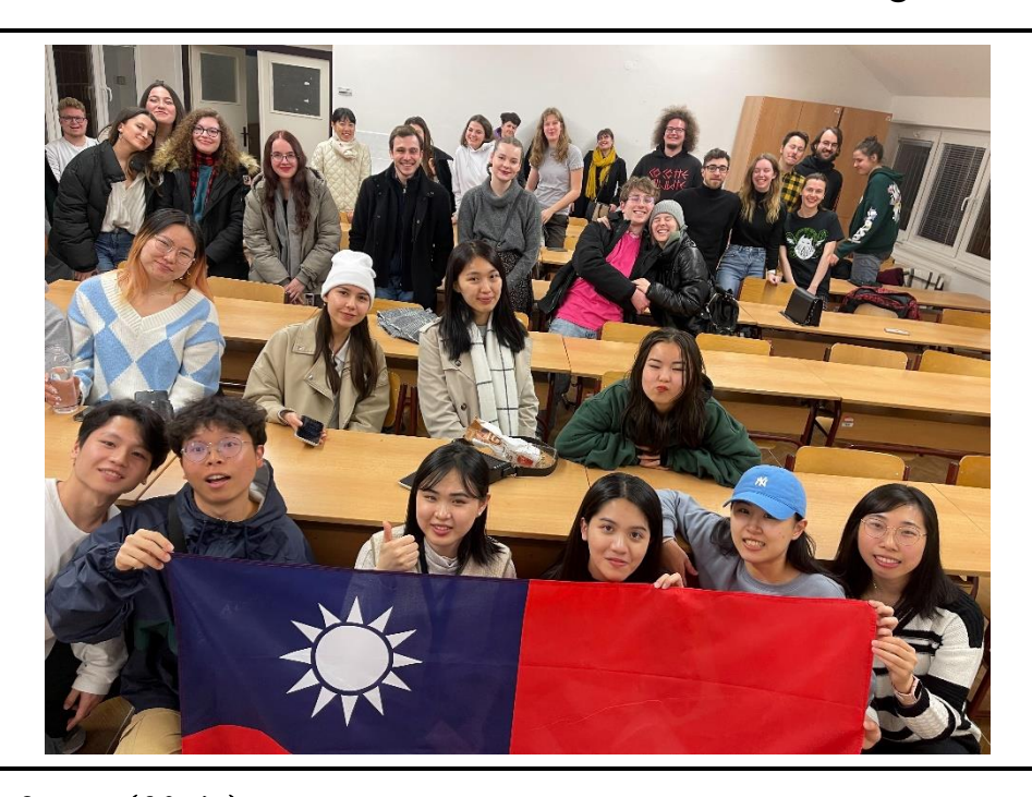
圖 3 說明(20 字)

It was snowing outside the dormitory that day, and exchange students ran to build snowmen and have snowball fights.