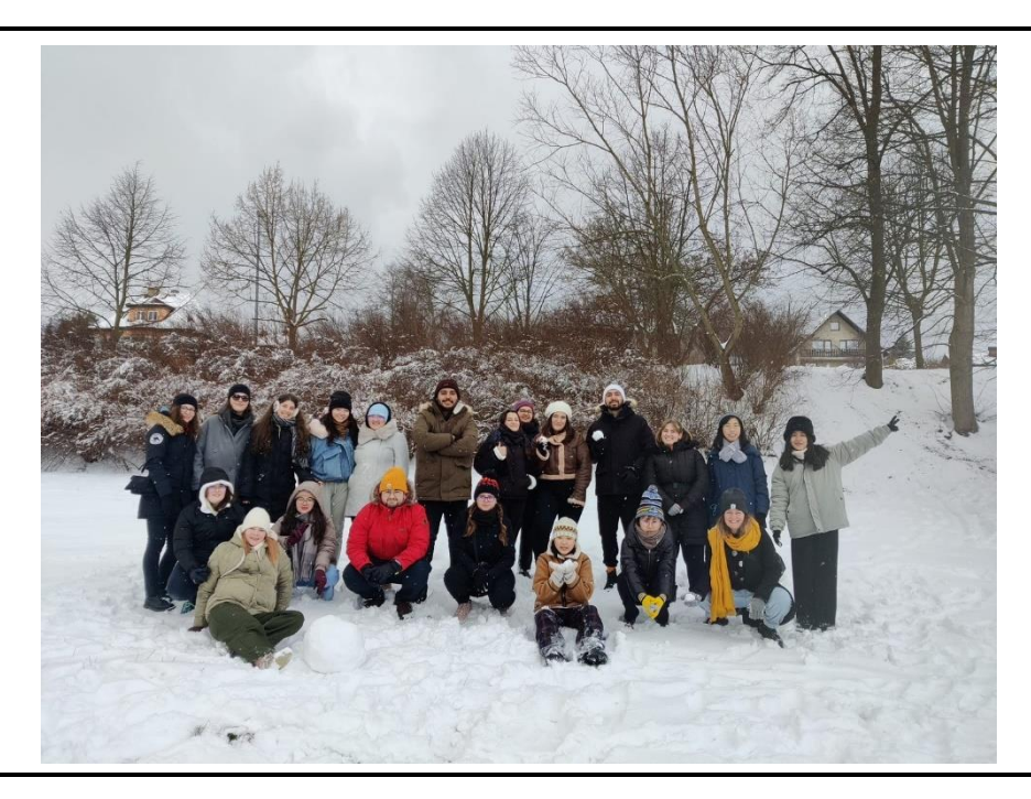
圖 2 說明(20 字)

It was snowing outside the dormitory that day, and exchange students ran to build snowmen and have snowball fights.