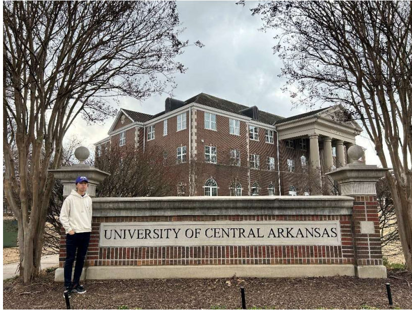
圖 1: Me and UCA