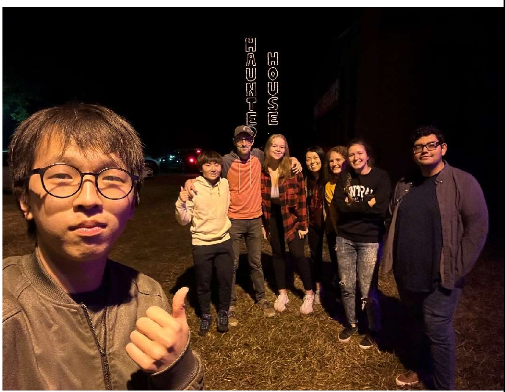
圖 4:Go to Hunted House at Halloween