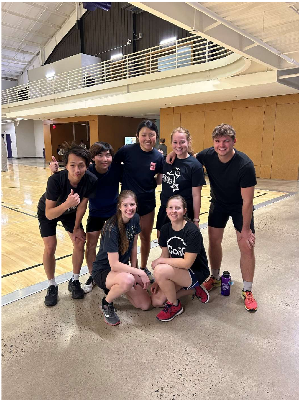
圖 3:Me and my volleyball team