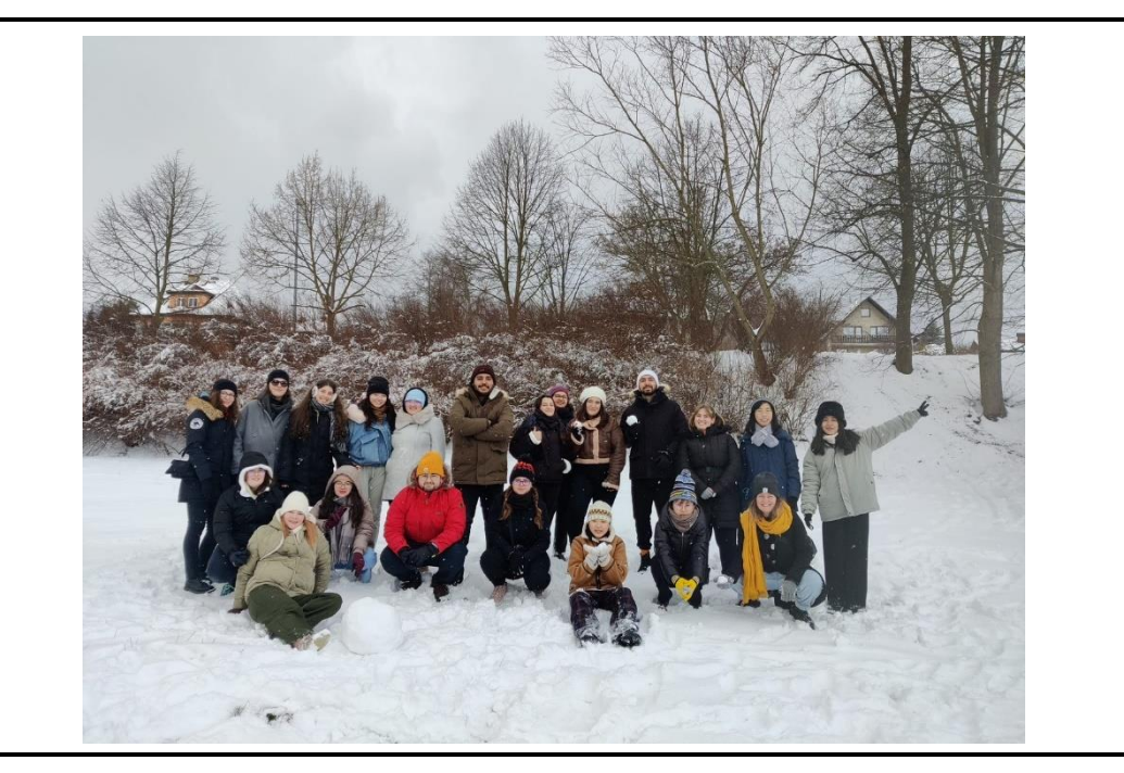
圖 2 說明(20 字)

It was snowing outside the dormitory that day, and exchange students ran to build snowmen and have snowball fights.