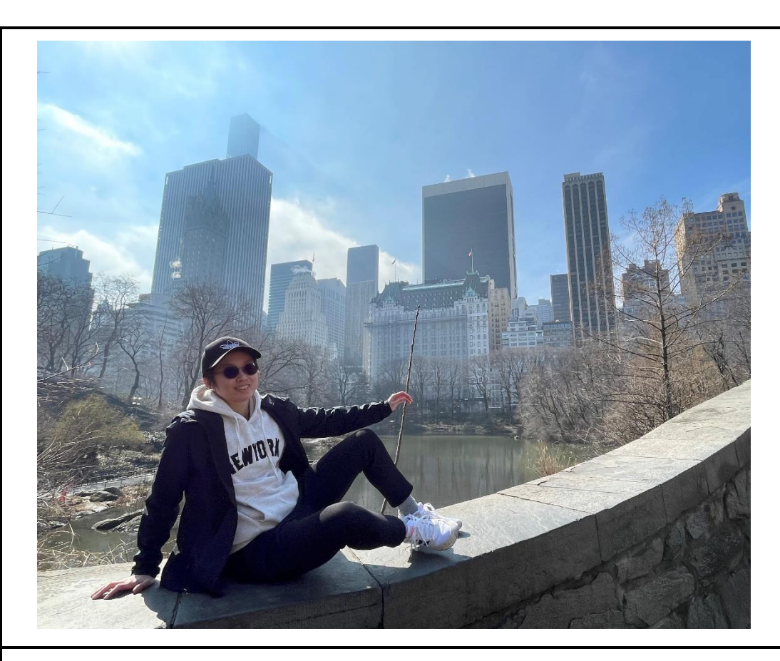
Spring break in New York City. Went to the Central Park on a sunny day. The view is marvelous definitely worth visiting again.