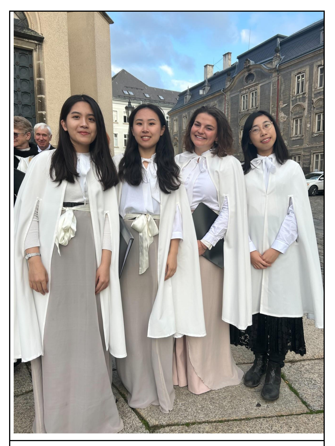
圖 3 說明(20 字)

Choir class, performed in two churches in the Czech Republic in traditional Catholic costumes with Swiss classmates, and it was our first time to perform in a church