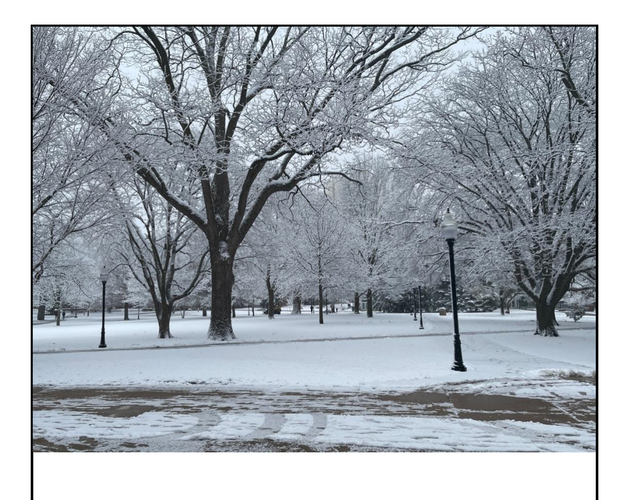
圖 2 說明(20 字)

It is my first time in the snow. Though the temperature was not that low for me, the wind was the problem I can't hold on.