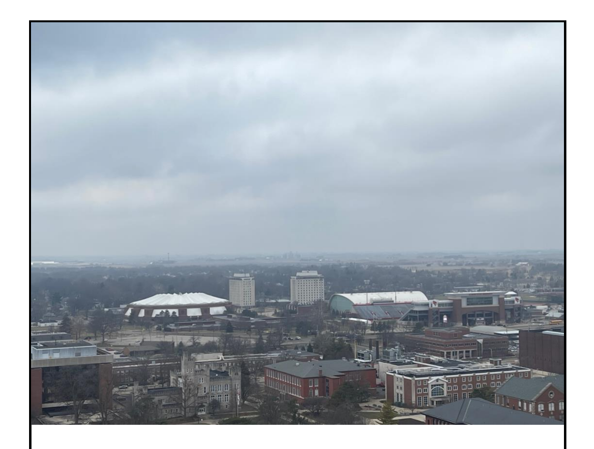
圖 3 說明(20 字)

This is the highest building in that city which is also the dorm of that university and I took this picture from the top.