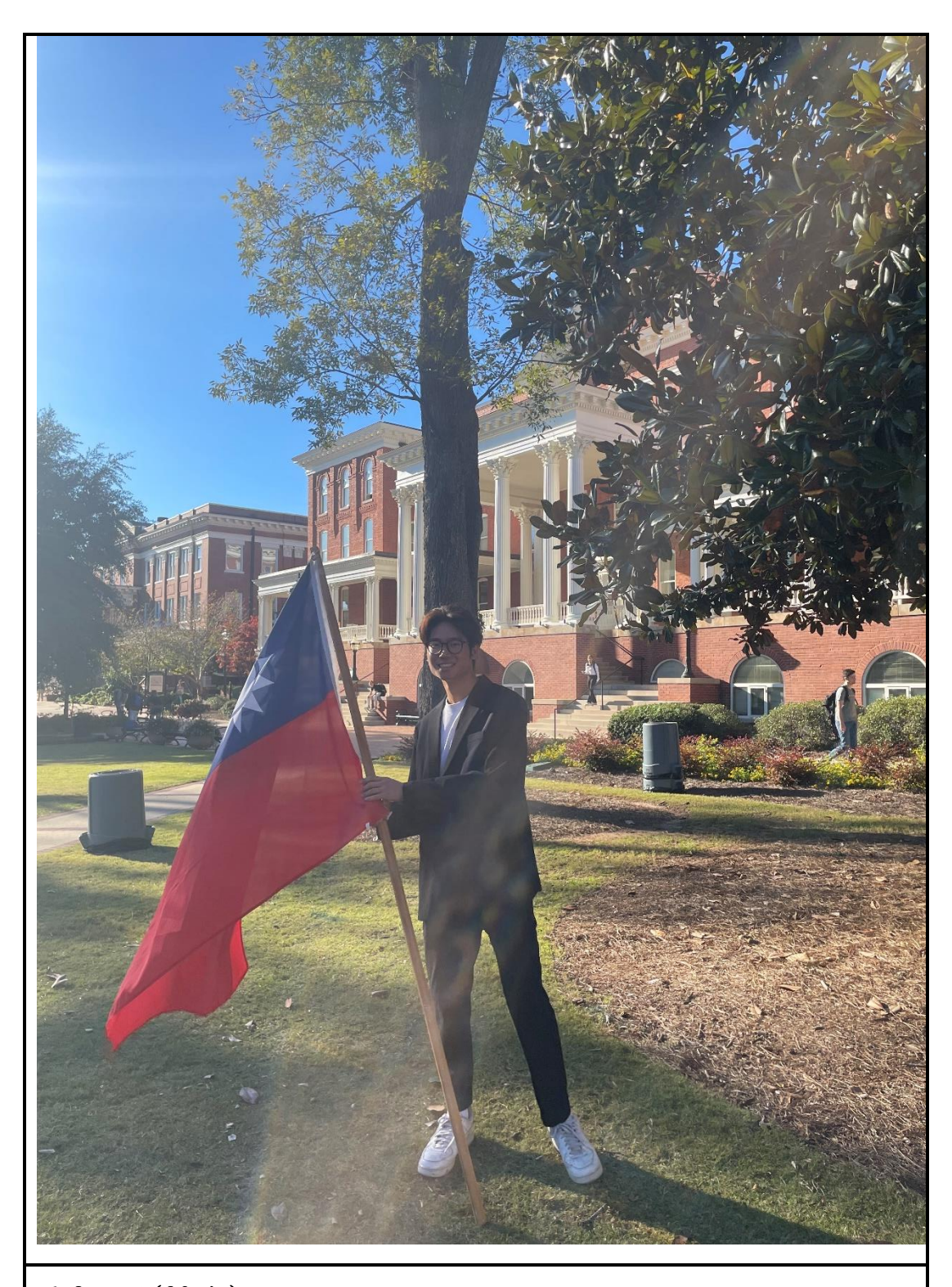
圖 3 說明(20 字)

This was international festival. On the event, we represented our countries and showed people our cultures. It was a perfect opportunity to stand for our countries.