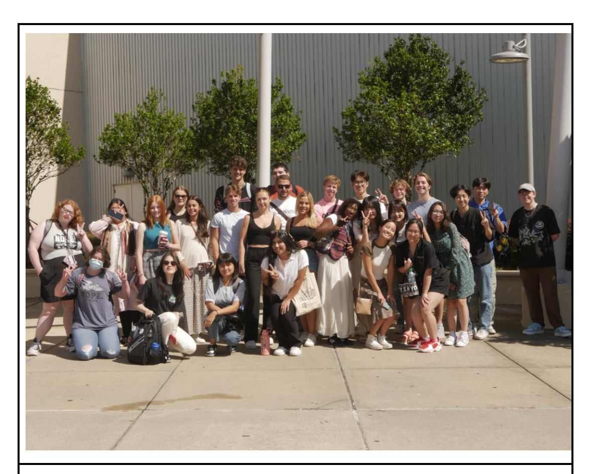
圖 2 說明(20 字)

This picture was recording all the exchange students I met at GCSU. It was a big family.