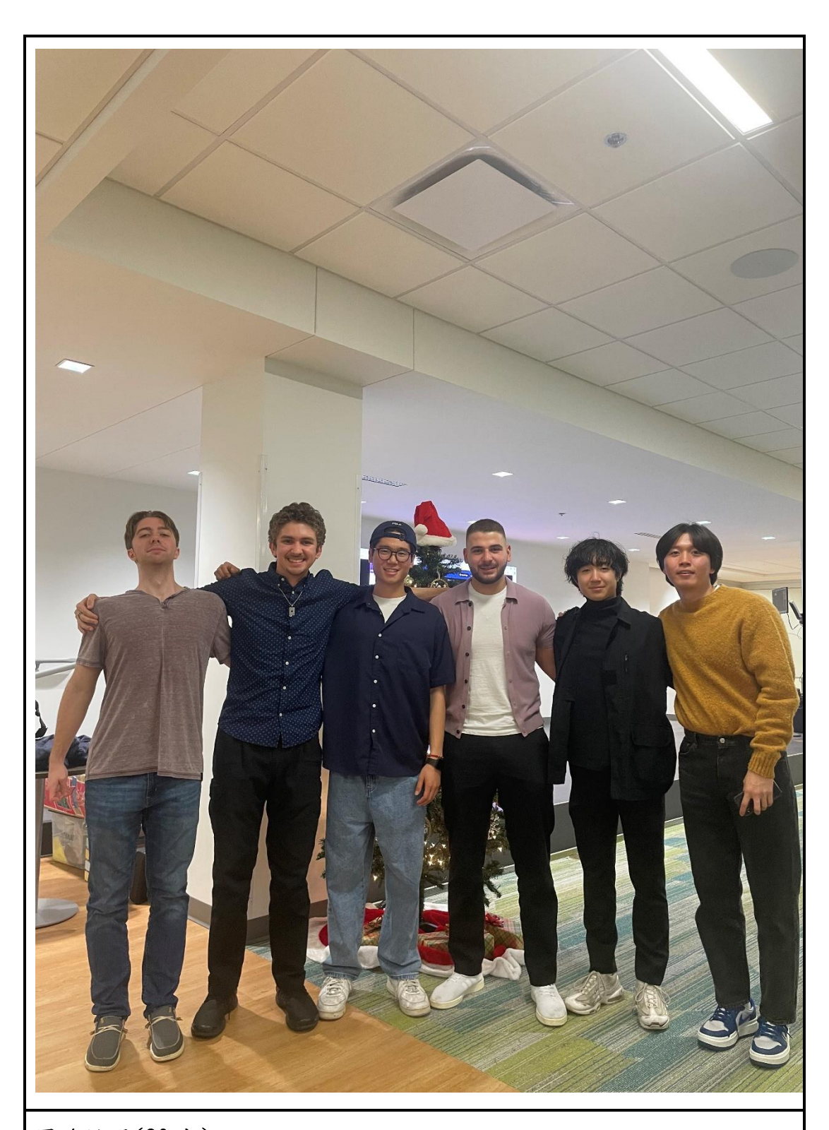
圖 4 說明(20 字)

This was the farewell party. I took the picture with all the friends I was close with.